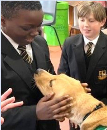
Strong links with the wider community

With great uncertainty around the future of Island primary schools, the economic and political climate, and the cost of living crisis, committing to a fee paying education can appear very daunting. We would therefore like to invite you to attend our Scholarship and Bursary Information Day on Thursday 6 June 2024 .